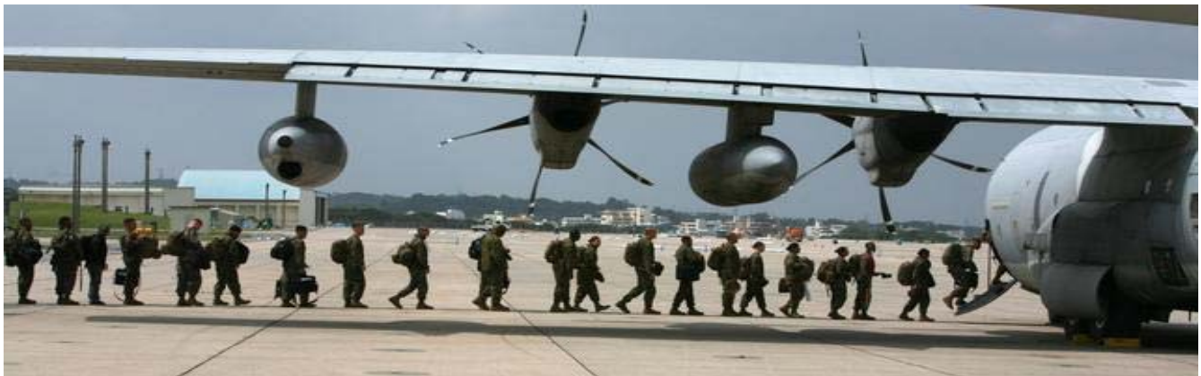
03/16/2011 - U.S. Marines assigned to Marine Aircraft Group (MAG) 36, 1st Marine Aircraft Wing (MAW), III Marine Expeditionary Force board a KC-130J Super Hercules aircraft at Marine Corps Air Station Futenma, Okinawa, before flying to mainland Japan in support of operation Tomodachi March 16, 2011. The Marines were expected to provide assistance to areas in Japan affected by a 9.0-magnitude earthquake and tsunami.